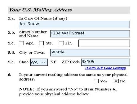
Item 5.a. - 'In Care Of' mailing address

Important mail about your OPT application, including your official receipt and Employment Authorization Document (approval card), will be mailed to the address you write here. If your mail is sent to someone other than yourself, please include an "In Care of Name" (Part 2, Item 5.a.—see screenshot below for example) as part of your mailing address.