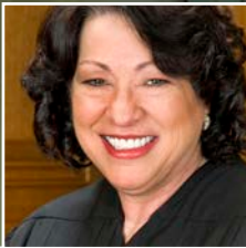
Supreme Court Justice Sonia Sotomayor in Prague